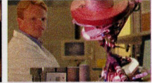
Customized robotically-bent archwires