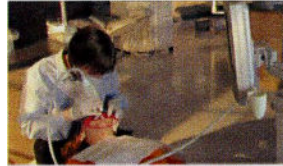
3-D intraoral scanning

SureSmile wires contain prescription bends to move your teeth more precisely into place. Because these highly accurate wires are custom-designed by Dr. Montano for you, fewer wire changes and appointments are needed. That can reduce your treatment time by as much as 40%!