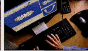
Computerized treatment planning